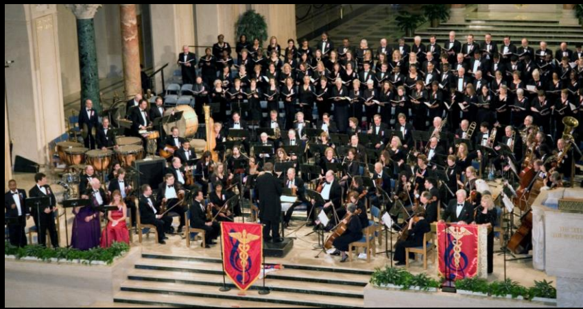
MEDICAL MUSICAL GROUP