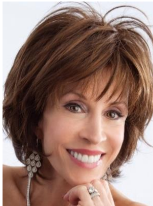
DEANA MARTIN SINGING DEAN MARTIN FAVORITES ON HIS 100 TH ANNIVERSARY

Our concerts are fast becoming musical mini-festivals. MMG singers and musicians travel from all over the USA, and are supplemented by gifted local performers. The program of music and readings features TV and screen stars as Narrators. The 2-hour extravaganza is taped live for broadcast.